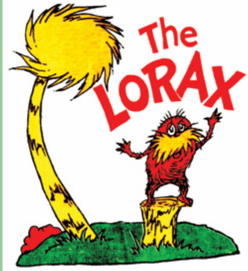
The Lorax , Dr Seuss, 1971

Technical Solution for the Phantom Problem Facilitates Broad Decisions on Compensation and Universal Service